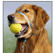
Premier Gentle Leader